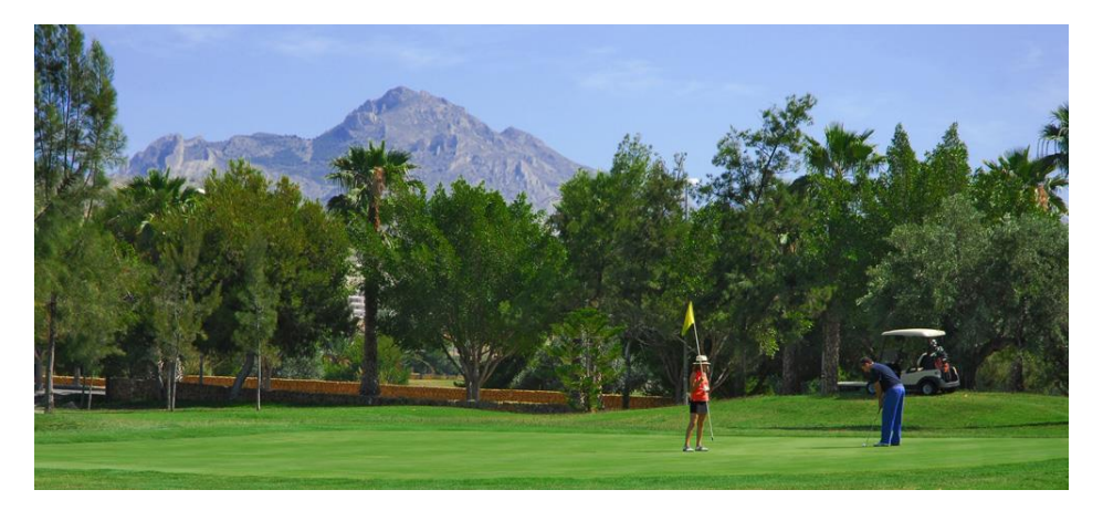
Sightseeing & Things to do page 1

Golf. You can find many gold courses in the area, such as Golf Resort Bonalba, Golf Sierra Cortina, Golf Med & Las Rejas Golf. At our homepage you can find links under the section "Things to do".